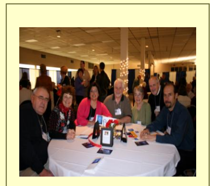
Fundraiser Guests 2010

In her mind, she couldn't possibly stay in a shelter. She has many chemical sensitivities and can't be around bed bugs and such, because she can't use the chemicals needed to get rid of them if they land on her body. She can't be around odors, or fragrances. They cause her to get headaches and feel ill. Continued on pg 5